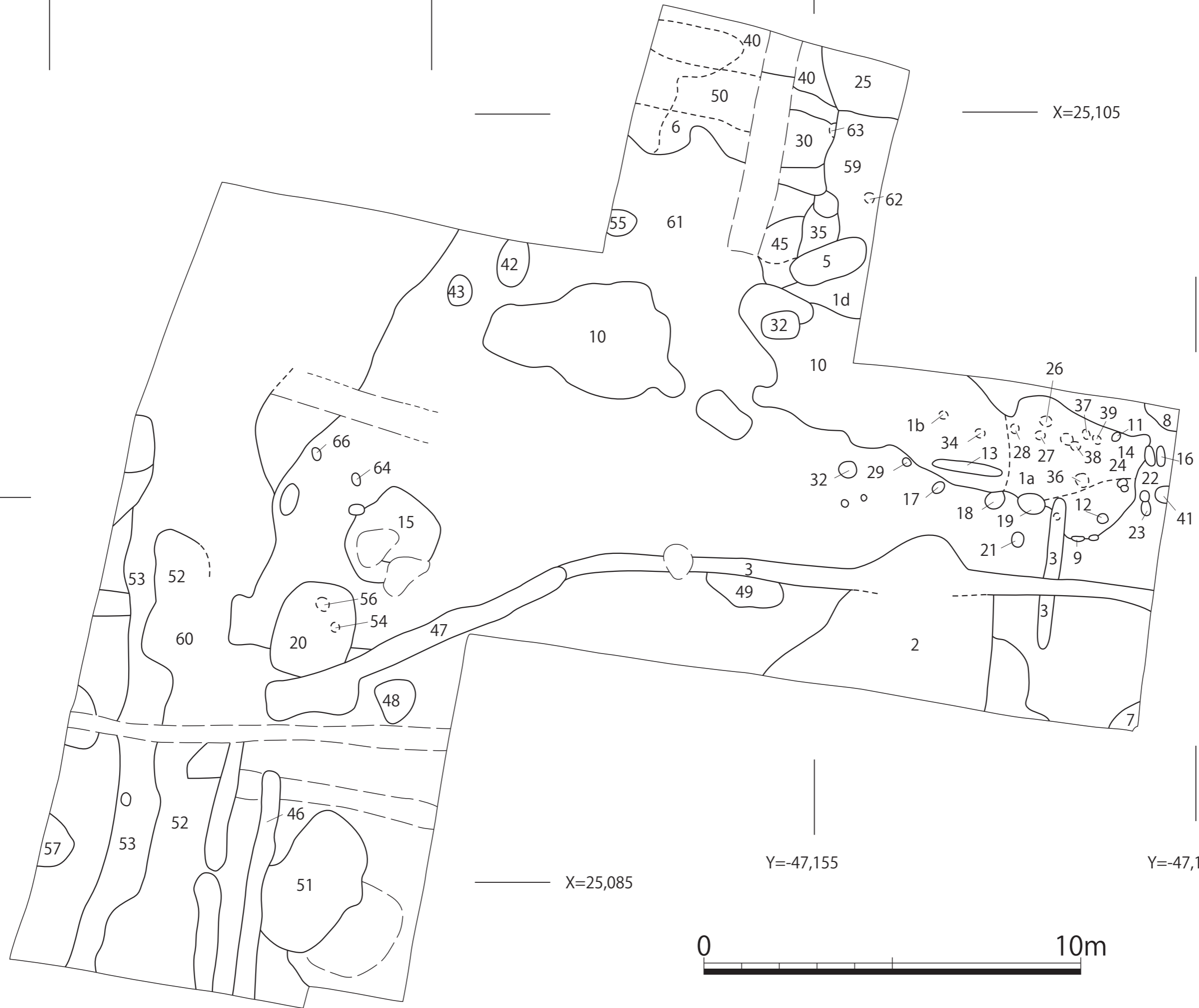
筑後市内遺跡群XII 熊野屋敷第3次調査 遺構略側図(1 / 100)